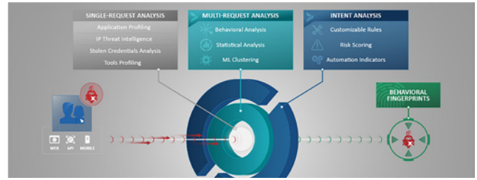
CQAI ML-based Analytics Engine

CQAI eliminates the need for JavaScript or SDK integration with more than 160 ML-based automation indicators that perform a multi-dimensional analysis of your web applications and APIs, resulting in a unique Behavioral Fingerprint that continually tracks sophisticated attacks, even as they retool to avoid detection.